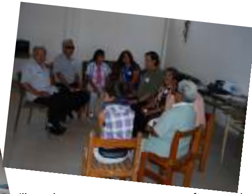
Classes in Braille and support groups are part of our work with persons who are blind in Aguascalientes.