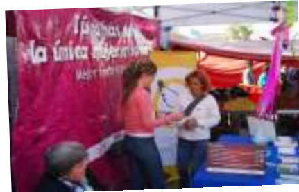
Volunteers join Comunidad staff to promote safe sex and healthy living.